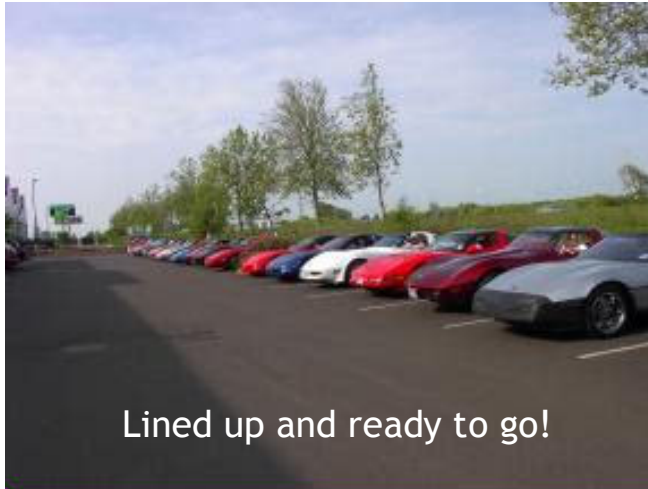
Lined up and ready to go!