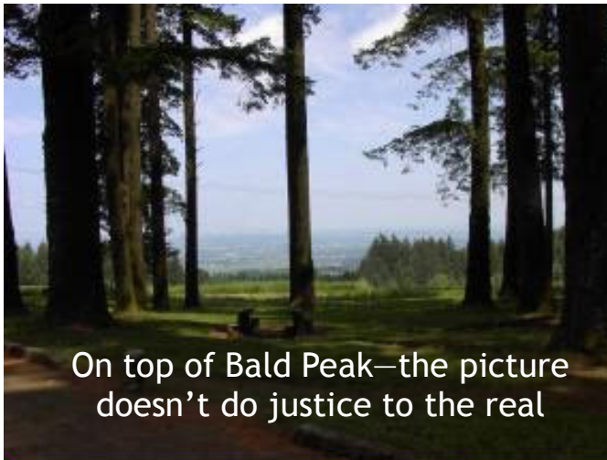
On top of Bald Peak—the picture doesn't do justice to the real