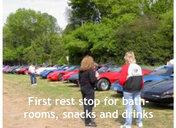
First rest stop for bathrooms, snacks and drinks