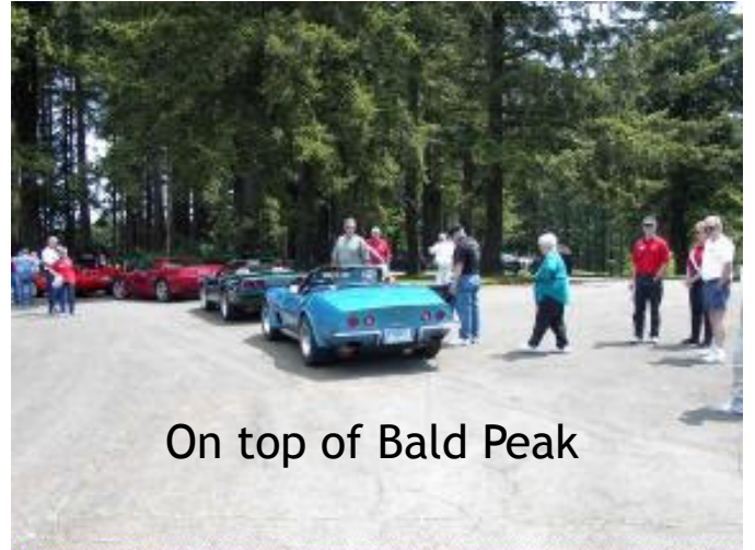
On top of Bald Peak