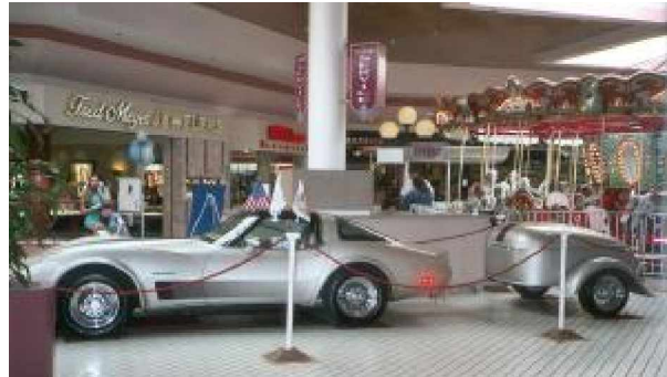
The Vices' 82 Collectors' Edition with matching trailer. Very nice!