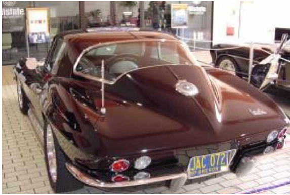
Jeff and Brenda's 66 coupe. Sorry, the photo doesn't do the black paint justice!

http://www.geocities.com/beaverstatecorvetteclub/photos/photo_index.htm